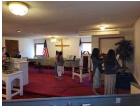
Voice and Instrumental Classes