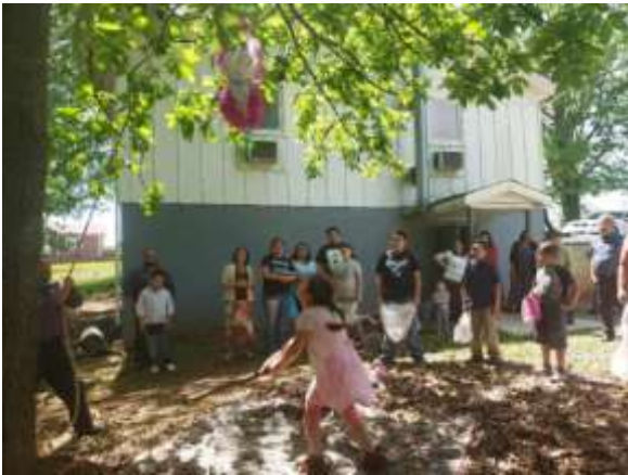
Celebration of Children's Day in our church