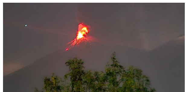
Volcano erupting near Ciudad Vieja