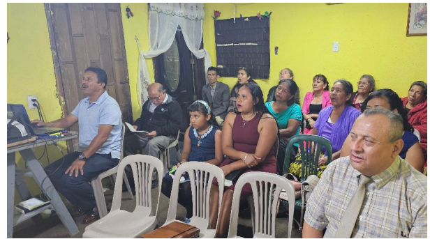
Church Service in Sakerty