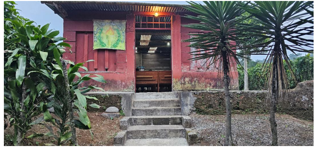
Church Building in Mercedes, Colomba