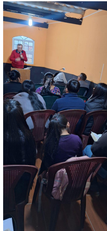
Church Service in San Martin, Sacatepquez