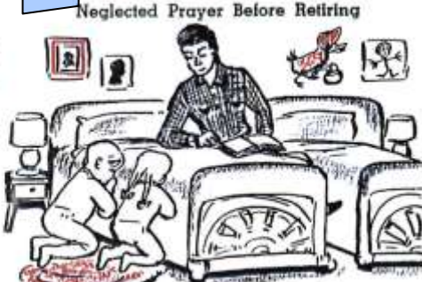
Not Fit to Pray after Late Show